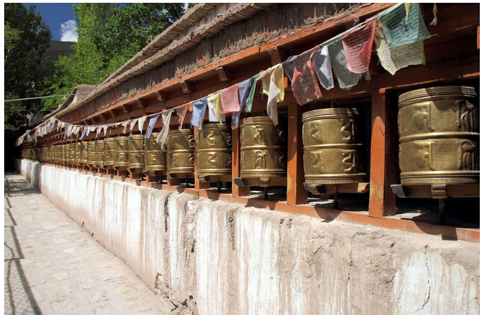
"Prayer rolls at the Chhoskhor Temple Complex - Alchi"

The Stewardship Committee hopes that you will enjoy spinning the wheel and learning more about the meaning of Stewardship as Christ at the center of all our lives.