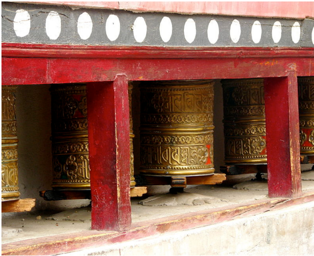
"Prayer Wheels in lower Leh"

In 1997 while traveling in India, I was fortunate to visit the Ladakh region in northern India. Most of the population in the area are Buddhists who focus on personal spiritual development and follow the teaching of Buddha, a monk and a philosopher.