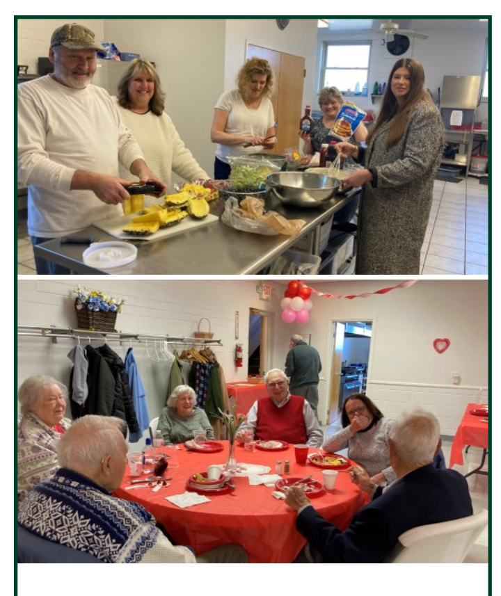
Thanks to the Evangelism Committee for the scrumptious Valentine's breakfast on Feb. 12!