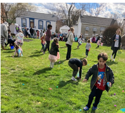
The hunt is on!