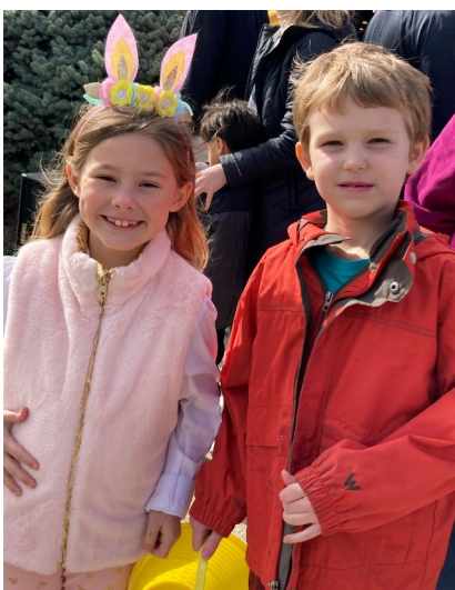
Neighbors and members all enjoyed the fun!