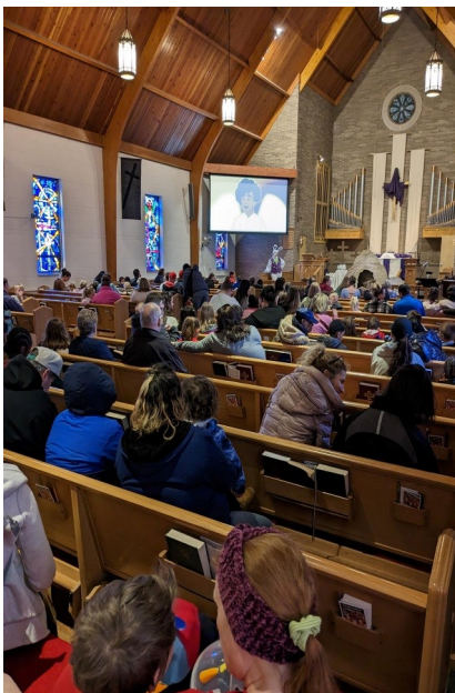
We had lots of visitors for the Easter Egg Hunt!